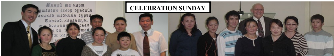
MONGOLIAN MISSION TEAM